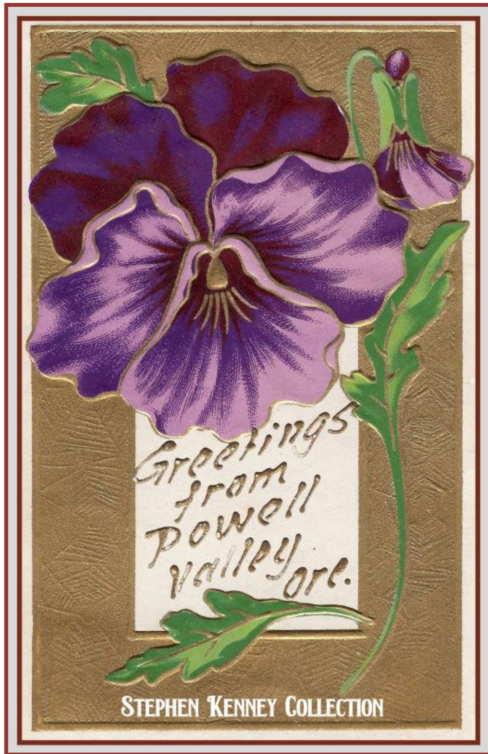
Greetings from Powell Valley postcard. Postmarked August 6, 1909 in Gresham, Oregon.