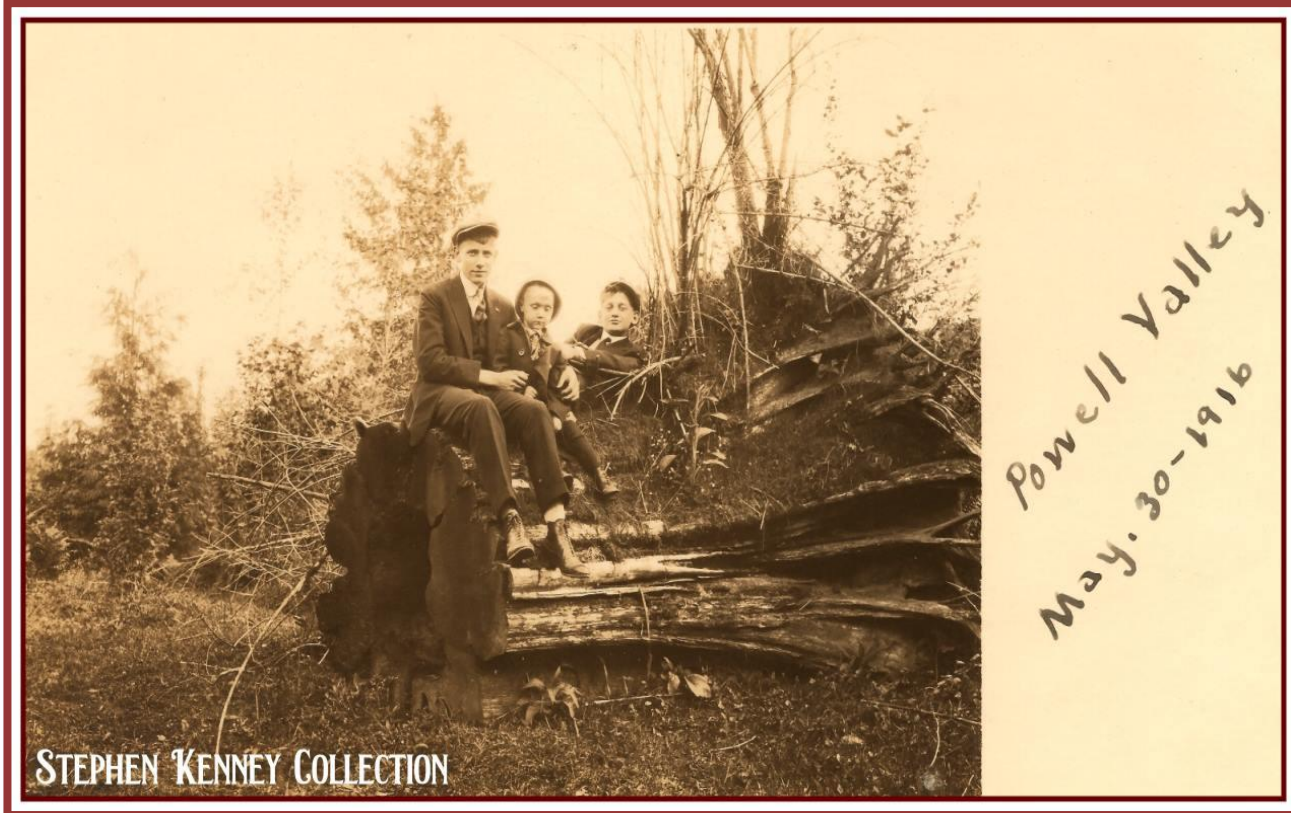
Real photo postcard at the Family Farm at Powell Valley, Oregon on May 30, 1916. Postally unused.