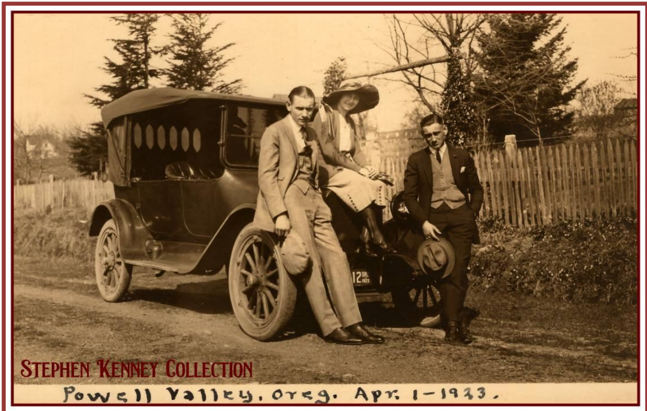
Real photo postcard at the Family Farm at Powell Valley, Oregon on Sunday, April 1, 1923. Published by Calvert Studio, Oregon City, Oregon, Postally unused.