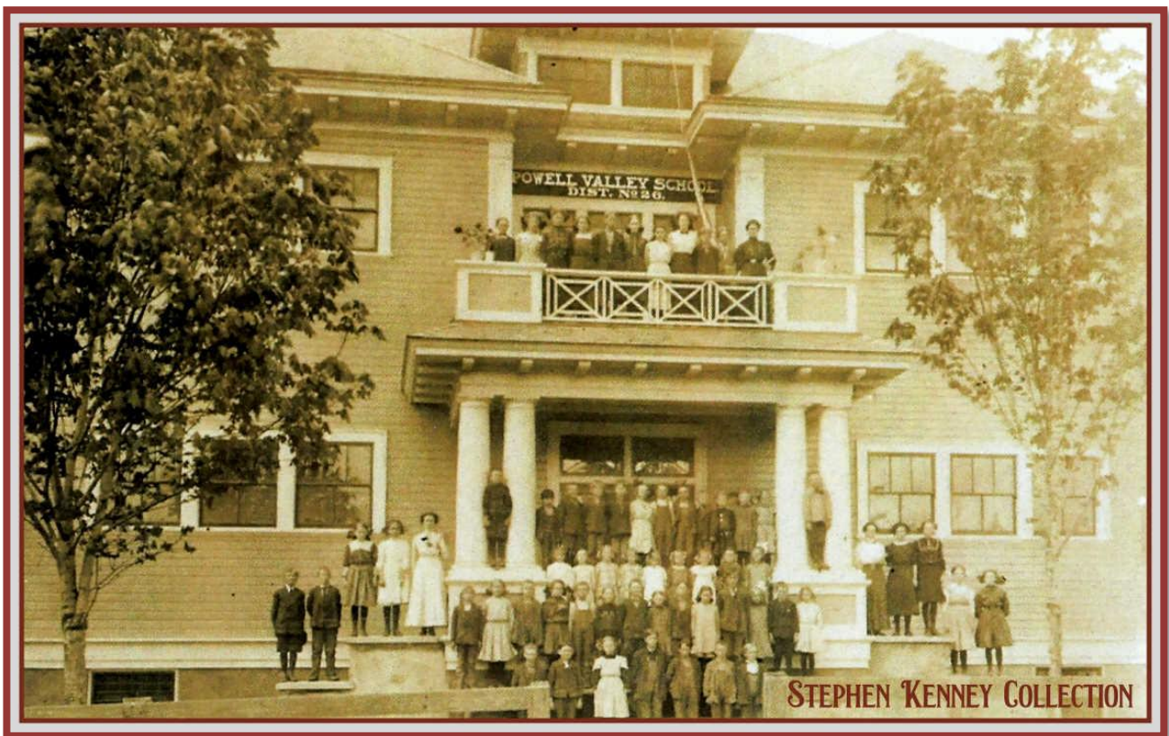
Real photo postcard of students and faculty at Powell Valley School in 1908. Postally unused. This district was established as Multnomah County School District No. 26 in 1857.