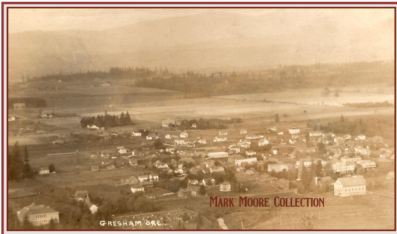
Real photo postcard with a Birdseye View of Gresham, near Powell Valley Road and Main Avenue, lower center, circa 1905. Postally unused.