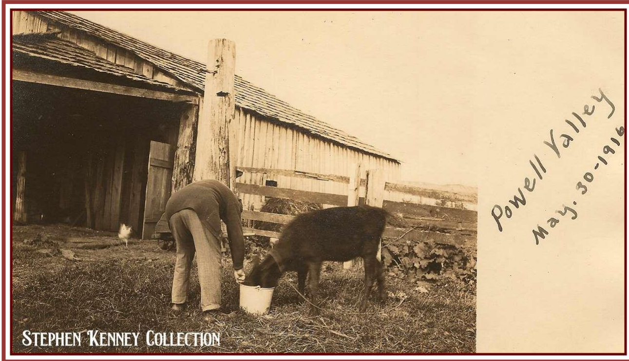
Real photo postcard at the Family Farm at Powell Valley, Oregon on May 30, 1916. Postally unused.