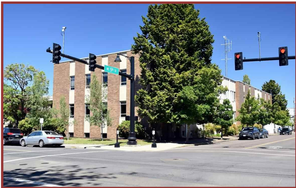
Photo of the Yamhill County Courthouse, 2024, Donald R. Nelson photo.

The Yamhill County Courthouse at NE 5th Street and Evans Street was built in 1888 and completed and opened in early 1889. This view is from the early 1950s. Structural deterioration problems led to the removal of the tower first and then the whole building. The structure was torn down and replaced with the current courthouse in 1964.