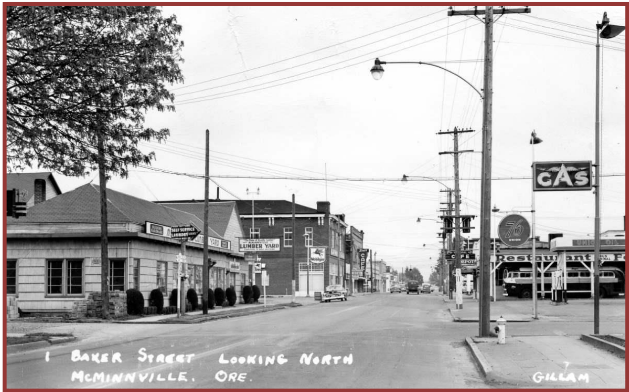
Gillam real photo postcard of Baker Street, circa early 1950s, Don Nelson collection.

The early 1950s view of NE Baker Street, from SE 1st looking north, exudes an old-fashioned small-town charm. McMinnville Lumber Yard is on the left. There are signs from three gas stations visible. A bus depot and the Depot Cafe can be seen on the right side of the image. The buildings featured prominently in this view no longer exist.