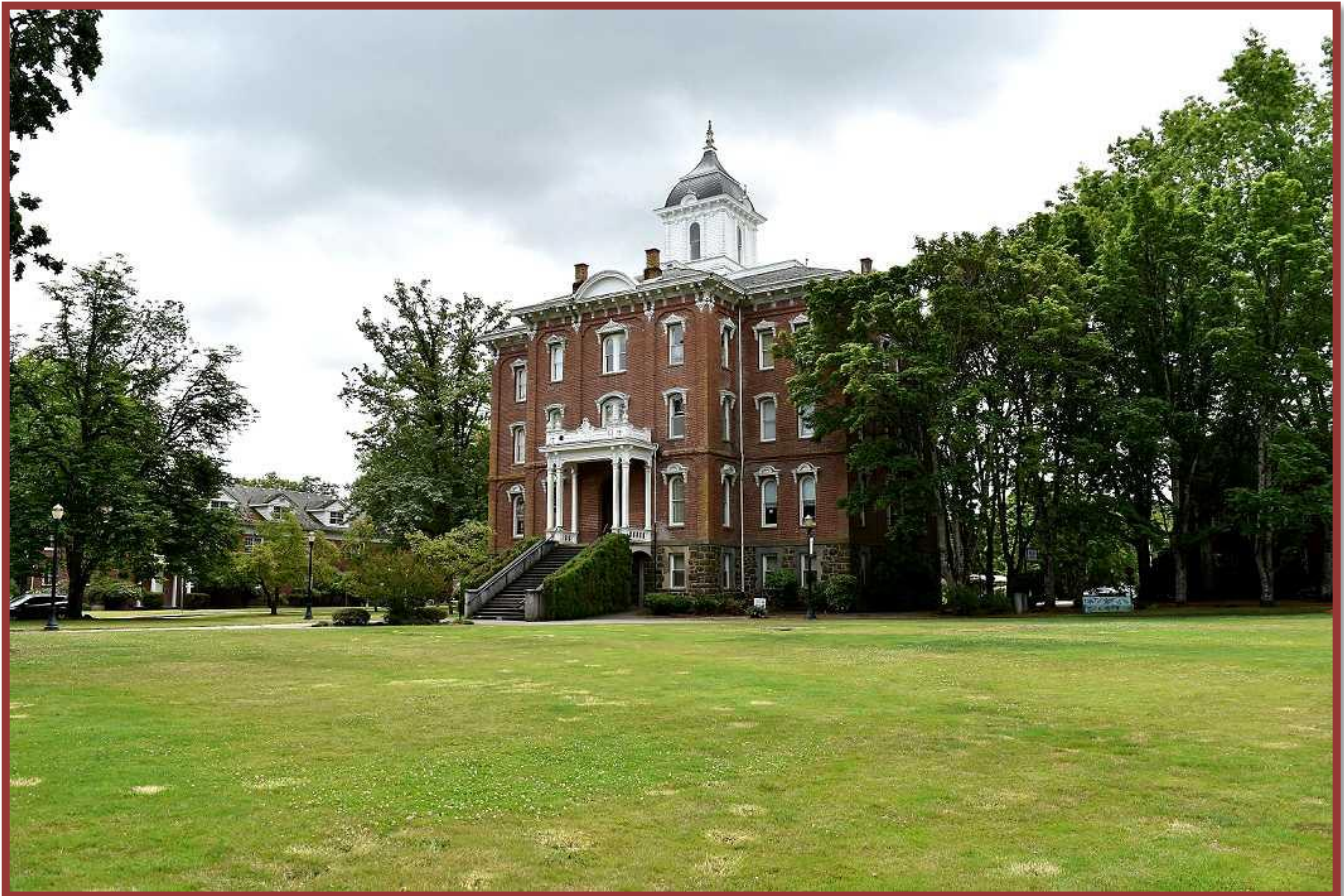
Linfield University, Pioneer Hall, 2024