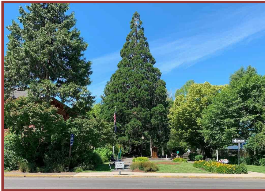
McMinnville City Park, 2024

This historically iconic view of the entrance to McMinnville's City Park, SW Adams Street at the west end of NE 3rd Street, shows the Carnegie Library on the left. In the left center background, is the Star Flouring Mills Co., built in 1881 and it operated into the 1920s. The mill was destroyed by a fire in 1927. In 1938, most of the building came down. In the center of the photo is a sign for an auto campground within the park. On the right side, is an auditorium for various events. It was razed in the 1920s.