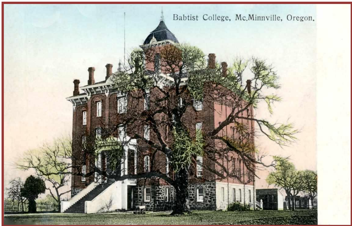
Lithographed hand-water-colored postcard of McMinnville Bab(p)tist College (now Linfield University), circa 1908.