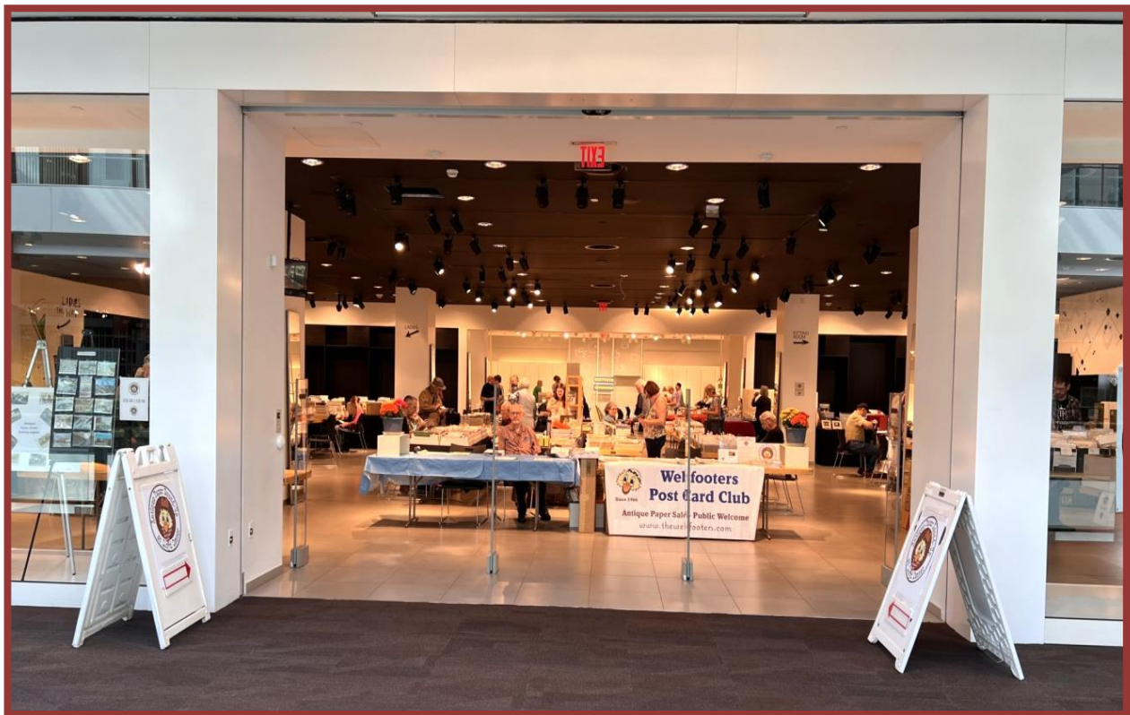
Entrance to the Webfooters 2024 Antique Paper Round-Up Show on Sept. 20 at Lloyd Center.

INSIDE: Reflecting on the 2024 Antique Paper Round-Up .....page 2 Annual Meeting Info .....page 6