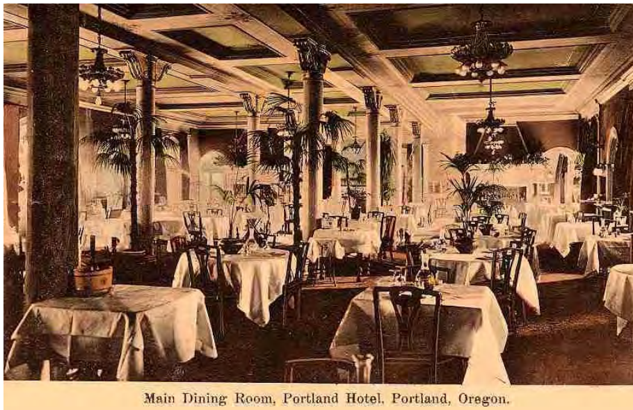
Main Dining Room, Portland Hotel, Portland, Oregon.

The service in the Main Dining Room, Portland's finest, had the reputation of being the slowest and stateliest on the coast. Eleven presidents stayed at the Hotel Portland and a set of Haviland China was purchased for each occasion.