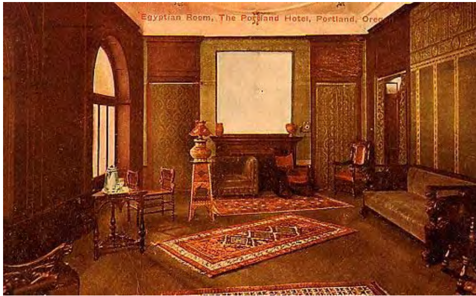
The ornately furnished Egyptian Room at the Hotel Portland