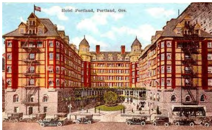
With seven floors, the Hotel Portland was the pride of Portland

The Hotel Portland was conceived just as the nation went into a recession and money from eastern investors dried up. Financial problems led to construction delays, which plagued the Hotel until local financing was obtained. This would prove to be a problem in later years.