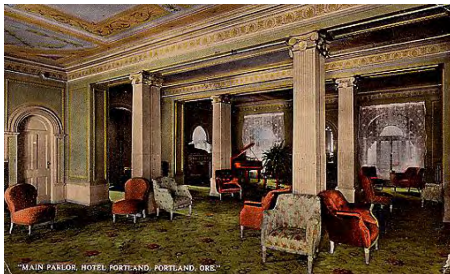
The opulent Main Parlor awaited guests at the Hotel Portland