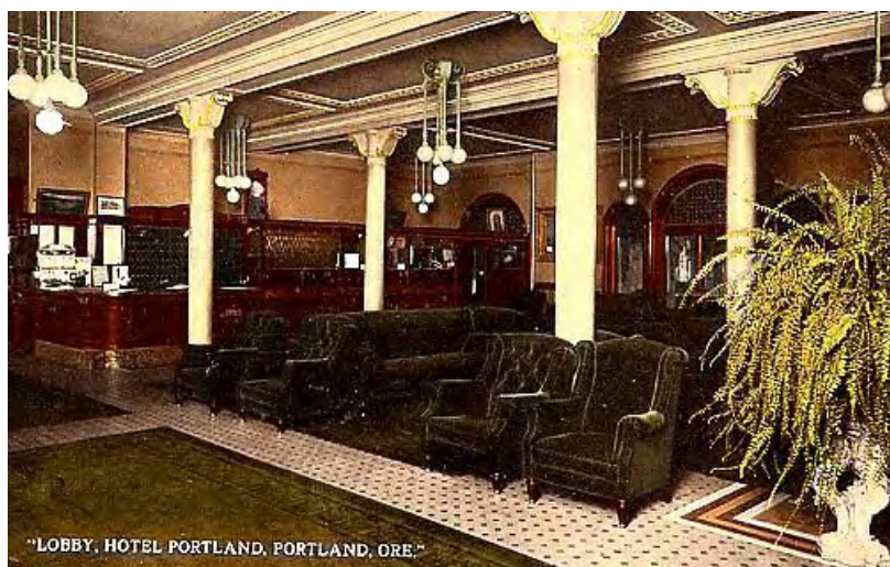
"LOBBY, HOTEL PORTLAND, PORTLAND, ORE."

The service in the Main Dining Room, Portland's finest, had the reputation of being the slowest and stateliest on the coast. Eleven presidents stayed at the Hotel Portland and a set of Haviland China was purchased for each occasion.