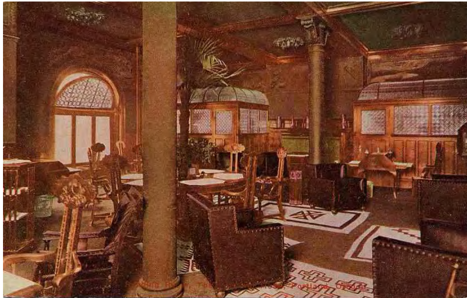
The lavishly appointed Reading Room at the Hotel Portland